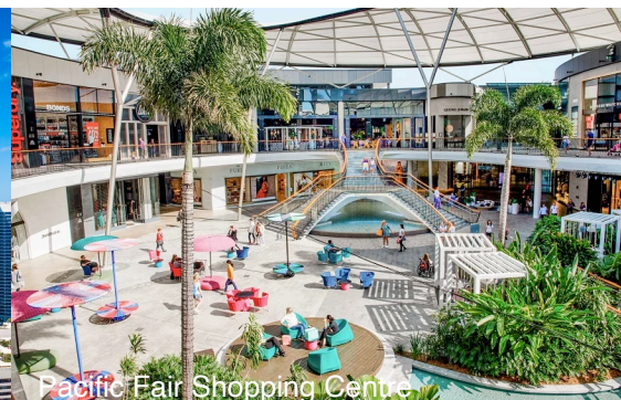
Pacific Fair Shopping Centre