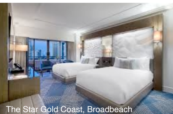
The Star Gold Coast, Broadbeach

Families are to enquire directly with TP World Tours for more details info@tpworldtours.com